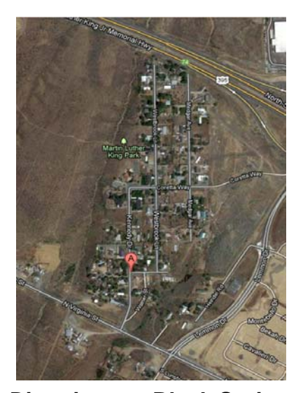
Directions to Black Springs From Reno/Sparks, take U.S. 395 north to the Lemmon Valley exit, turn left. Go to North Virginia Street, turn right. Proceed to Kennedy Drive, turn right.